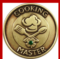
ND State Fair Pin