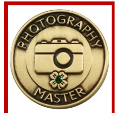
ND State Fair Pin