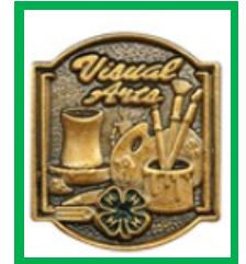
ND State Fair Pin