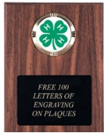
#2 - 5x7 Custom Wood Plaque 40 characters allowed on each line BUT no more than 100 characters total