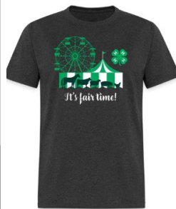
#7 - It's Fair Time Tee Sizes: AS-6XL