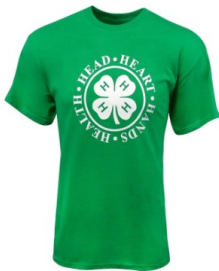
Sizes: YS - 3XL