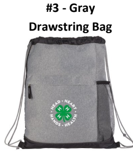
#3 - Gray Drawstring Bag