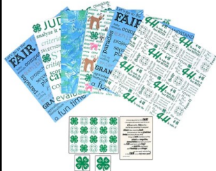
#18 - Fair Scrapbook Kit