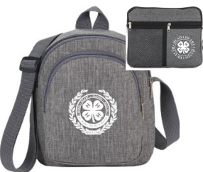
#10 4-H Mini Cross Body Sling & Travel Bag