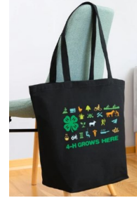
#5 - Icon Tote