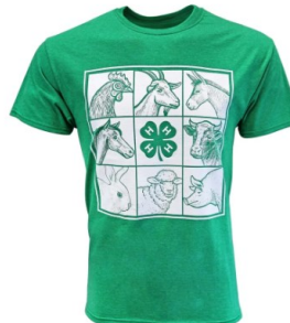
#8 - Brady Bunch Tee Sizes: AS-3XL