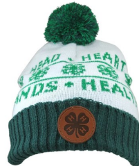
#13 Patterned Beanie