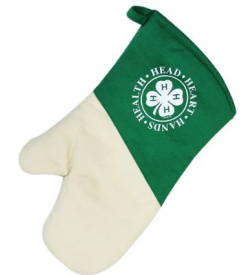
#17 - Oven Mitt