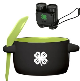
#19 - Ceramic Bowl/Spoon & Binoculars