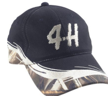
#14 - Great Outdoor Cap