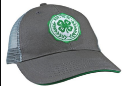
#15 - Seal Gray Trucker Cap