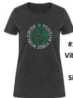
#12 - Positive Vibes Women's Tee Sizes: AS-AXL