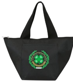
#3 - Zipper Lunch Bag