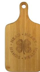
#20 - Engraved Bambo Cutting Board