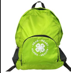
#1 - Collapsible Back Pack

SENIORS: 200 - 349 POINTS (13 to 18 yrs)