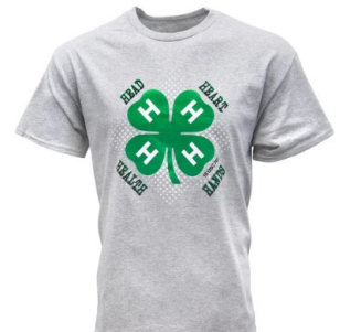
#10 4-H Spots Tee Sizes: YS-3XL