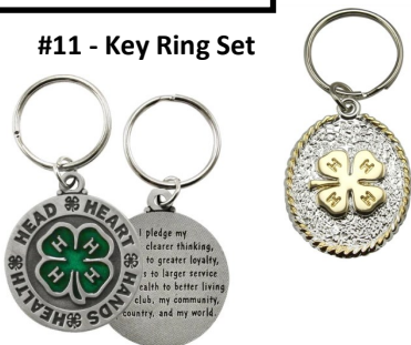
#11 - Key Ring Set