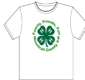
Sizes: YS - 3XL