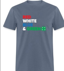
#9 - Red, White, Blue, & Green Sizes: AS-4XL