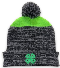
#12 Knit Pom Beanie