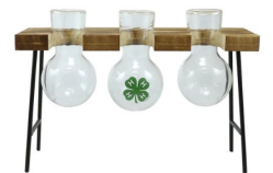
#24 - Hydroponics Vases