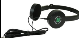
#20 - Headphones