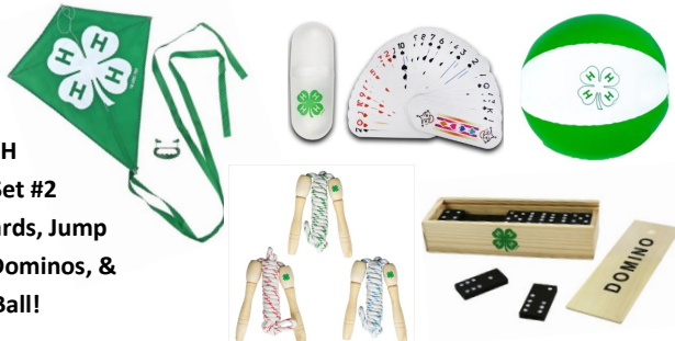
#14 - 4-H Game Set #2 Kite, Cards, Jump Rope, Dominos, & Beach Ball!