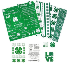
#19 - Best Better Scrap. Kit