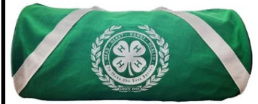
#1 - Crest Duffle Bag