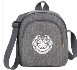
#4 - 4-H Mini Cross Body Sling