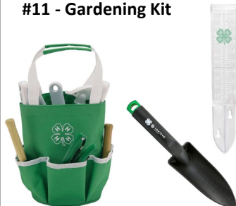
#11 - Gardening Kit