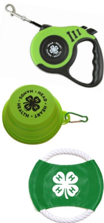
#16 - Dog Set #1 (leash, bowl, toy)