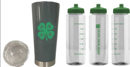
#7 - Cup Set