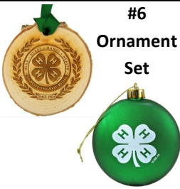
#6 Ornament Set