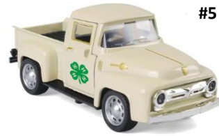
#5 – Diecast Pickup Truck

SENIORS: 200 - 349 POINTS (13 to 18 yrs)