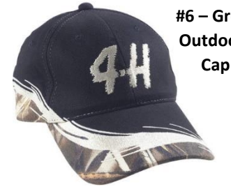
#6 – Great Outdoors Cap