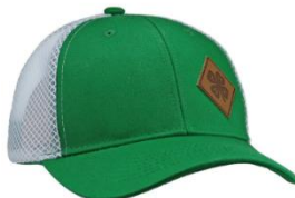
#18 – Ponytail Hat