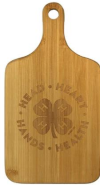
#3 – Engraved Cutting Board Size: 10"x5.5"