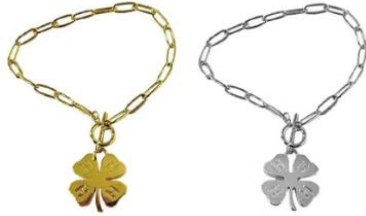
#2 – Charm Bracelet Choose Gold or Silver