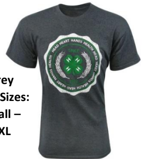
#15 – Grey Clover Tee Sizes: Adult Small – Adult 3XL