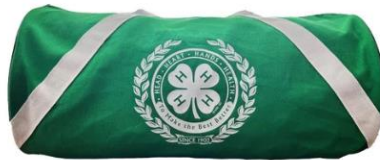
#14 – Crest Lightweight Cotton Duffle Bag Size: 20"x9.75"