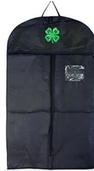
#4 – Garment Bag Size: 24"x40"