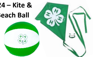
#24 – Kite & Beach Ball