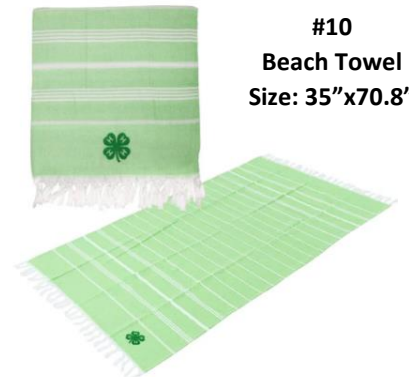
#10 Beach Towel Size: 35"x70.8"