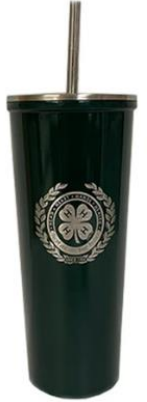
#6 – Crest Stainless 24 oz Tumbler