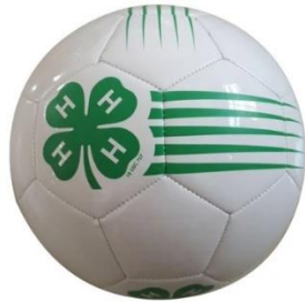
#8 – Soccer Ball