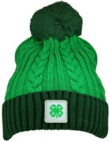
#1 4-H Cable Knit Beanie