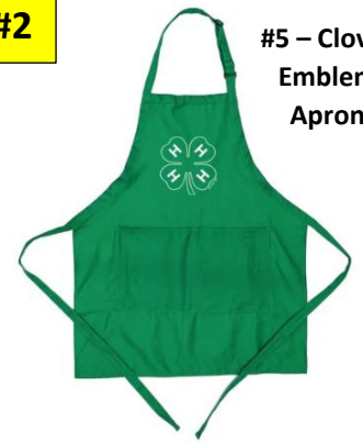
#5 – Clover Emblem Apron