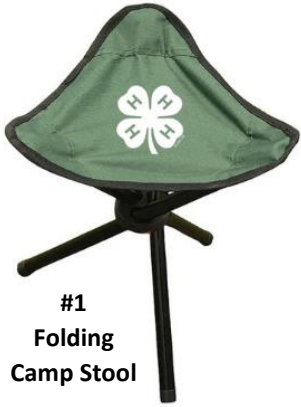
#1 Folding Camp Stool

SENIORS: 350 - 499 POINTS (13 to 18 yrs)