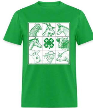
#9 – Brady Bunch Tee Sizes: Adult Small – Adult 2XL