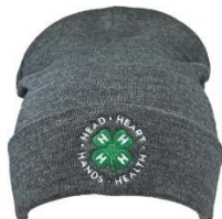
#17 – Gray Beanie