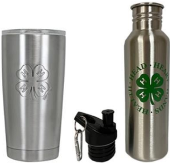
#11 – Double Wall Tumbler & Stainless Bottle