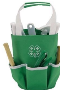
#22 – Tool Tote Size: 8"x8"