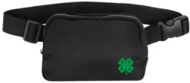
#7 – 4-H Anywhere Bag Size: 72.5"x5" w/ 28" belt