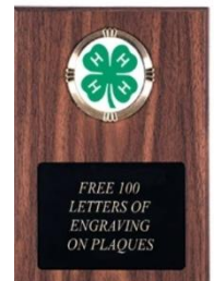
#23 – 5x7 Custom Plaque 40 characters allowed on each line BUT no more than 100 characters total