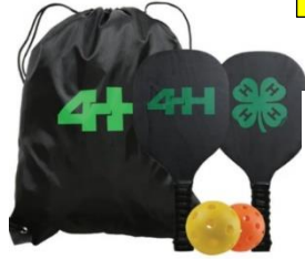
#3 – Pickleball Paddle Set