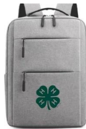
#13 – Grey Backpack Size: 11.8"x4.72"x16.5"