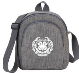
#13 – Mini Cross Body Sling