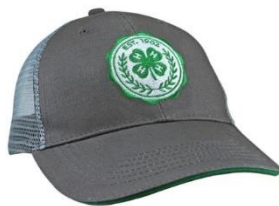
#20 – Gray Trucker Cap