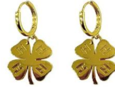
#4 – Clover Charm Earrings Choose Gold or Silver