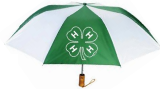
#21 – Folding Umbrella - Size: 42"