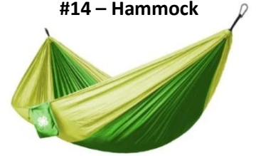
#14 – Hammock