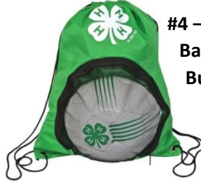
#4 – Soccer Ball/Bag Bundle