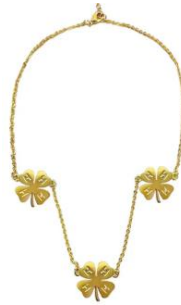
#3 – Clover Charm Necklace Choose Gold or Silver