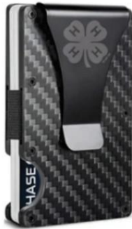
#2 - Engraved RFID Blocking Wallet