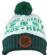
#19 – Pom Pom Beanie