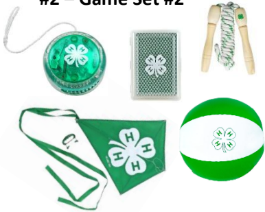
#2 – Game Set #2