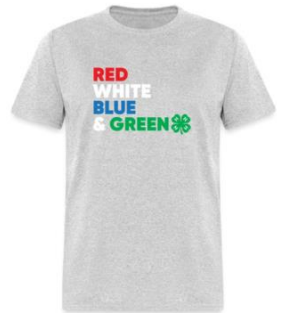
#10 – R/W/B & Green Class T-Shirt Sizes: YS – Adult 3XL